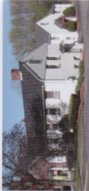
Lexington Arts & Crafts Society has an 11,000+ square foot facility housing galleries, classrooms, well-equipped studios and workshops.

LACS offers a wide range of classes, workshops and demonstrations to members and the public. There is a full calendar of events, sales and shows throughout the year.