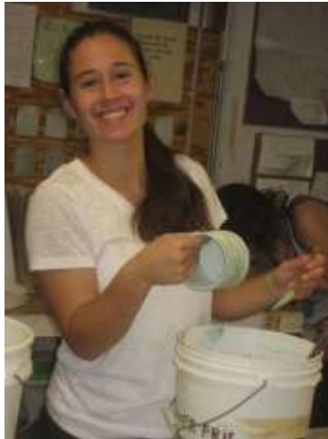
Ceramics Studio Teen Pottery