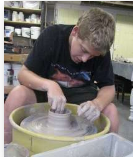
Ceramics Studio – Teen Pottery