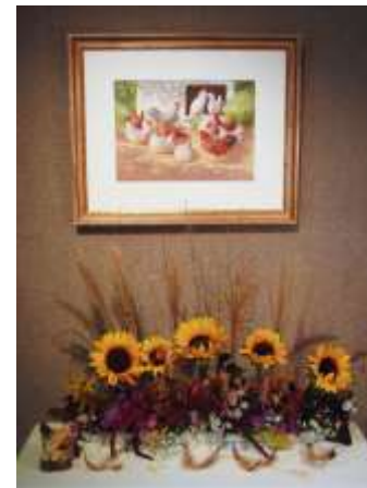
Past Art-a-Blooming Exhibit