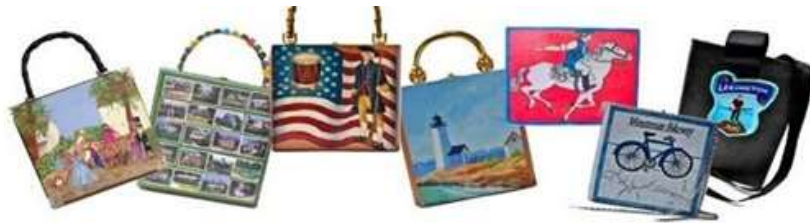
Lexington Arts and Crafts Society and the 300th Celebrations Committee