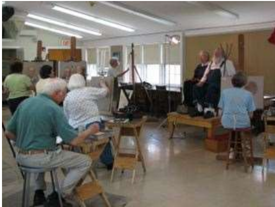
Painters Studio Portrait Drawing

Meeting Room/Classroom Chinese Lanterns Middle School Field Trip