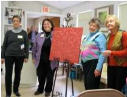
Luncheon Reception at LACS during their visit April '10