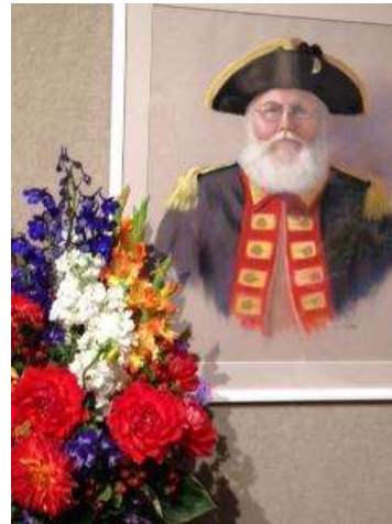
Bi-ennial Collaborative - LACS and Lexington Field and Garden Club